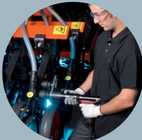
Farm equipment (Seeders)