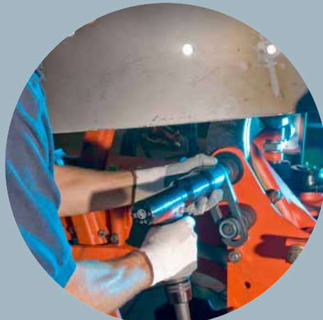
Farm equipment (Plow)